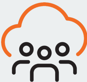
Simple sharing and impactful engagement

Engage your organization and build cohesion throughout your intranet across PCs, Macs, and mobile devices. Drive organizational efficiency by sharing common resources and applications on home sites and portals. Tell your team's story with beautiful communication sites. And stay in the know with personalized, targeted news on the web and the SharePoint mobile apps.