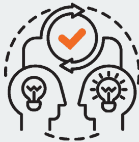
Harness collective knowledge