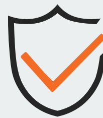
Integrated security solutions