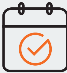
Real-time scheduling and booking