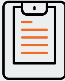
Regular event log analysis