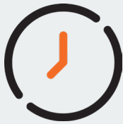
Fast setup and performance