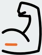
Strong technology backed by strong analysts