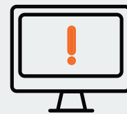
Fast, confident response